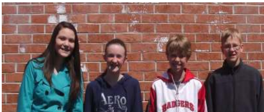
2011-2012 Student Council Officers